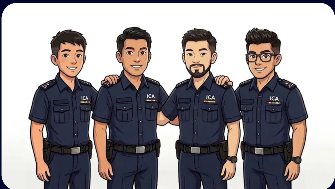
Image generated by AI for privacy reasons